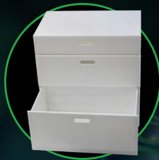
Dimensions and number of drawers customizable