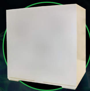
Raised back wall for ease of cleaning